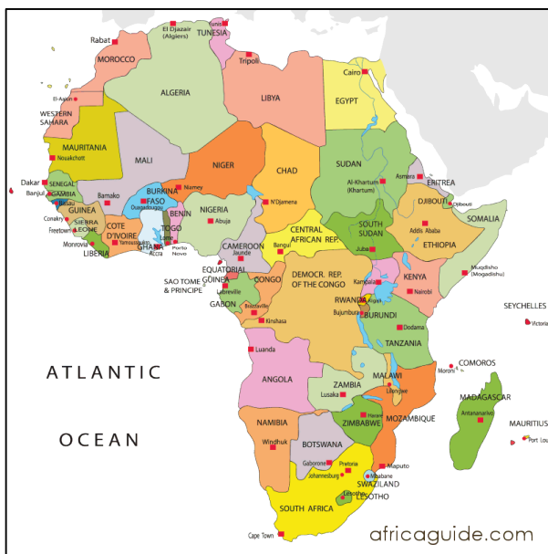
Map 2: Contemporary Africa

It is very difficult, in fact impossible, to gauge or predict the prospects of democracy in Africa, or in any single African country. Africa is enormous and diverse. Its 54 states have different colonial legacies (Anglophone, Francophone, Lusophone) and varied political systems (monarchical, presidential, parliamentary). With an area of 30.3 million km 2 , Africa is larger in size than China, Europe, India, Japan and the United States put together. It is home to 1.1 billion citizens; more than 2,000 languages;